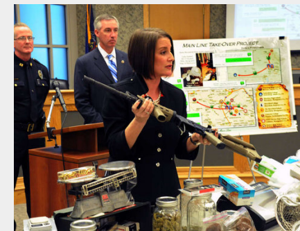
Main Line Drug Ring Charges