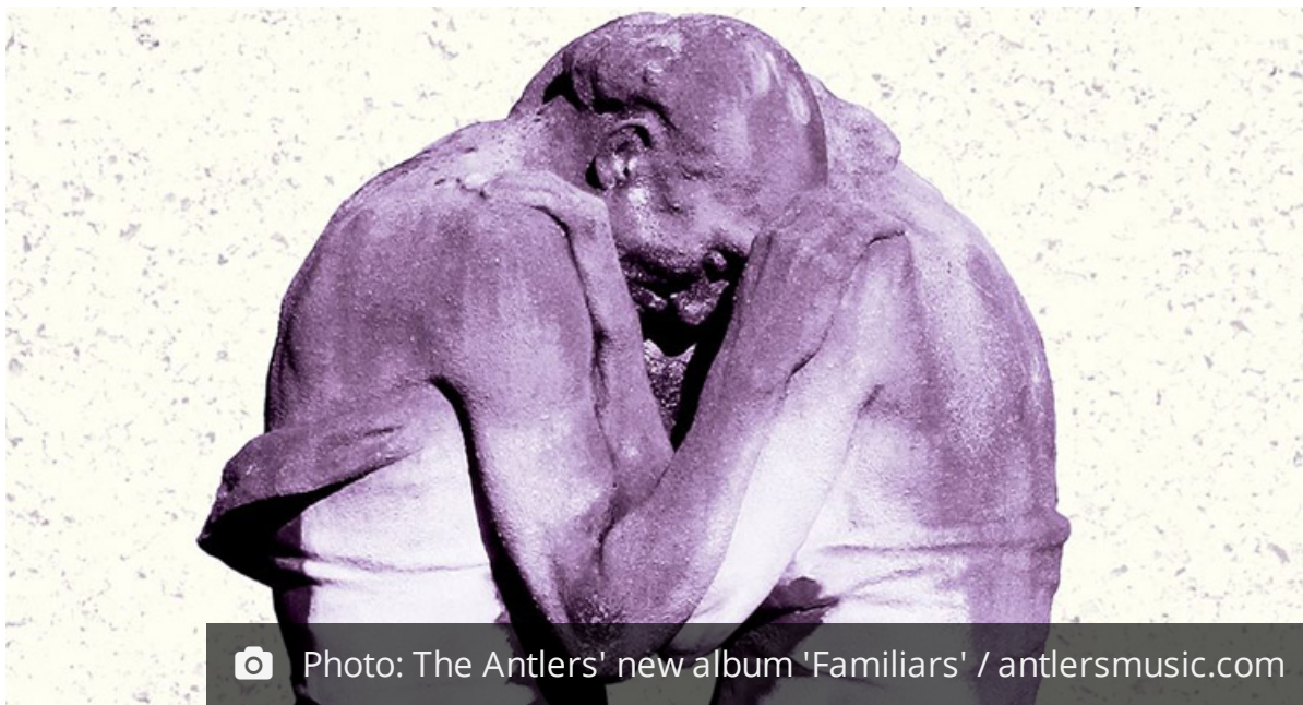
Photo: The Antlers' new album 'Familiars'