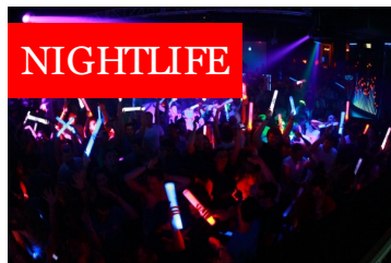
Where To Go