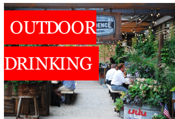
Where to Drink