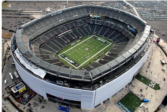
Getting to Metlife Stadium with public transportation