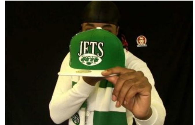
Best places to get New York Jets gear for football season