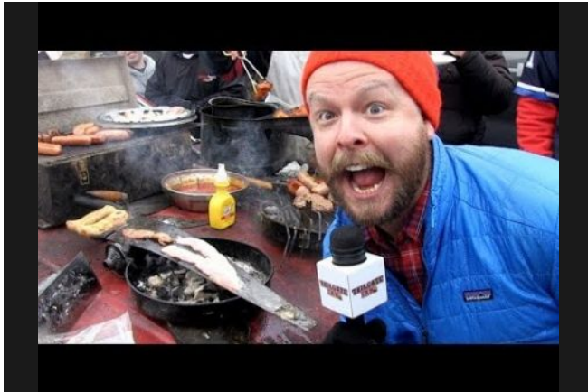
History of Buffalo Bills tailgating: 54 Years of beer and pignskin