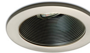
HR-D411 4" Premium Low Voltage Downlight