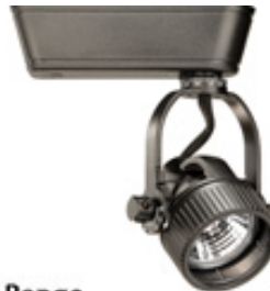
Range 120V Track Luminaires